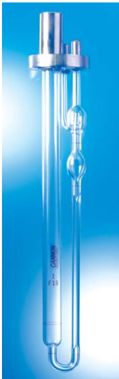
9723-A50 Series 9723-B50 Series