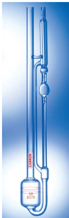
9721-J50 Series 9721-K50 Series

Holder is not supplied. For holders, see 9726-M70, -M73, and -M76 on page 15.