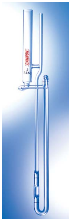
9723-S50 Series 9723-U50 Series