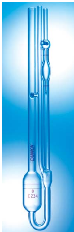
9721-N50 Series 9721-R50 Series 9721-U50 Series