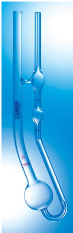
9721-A50 Series 9721-B50 Series