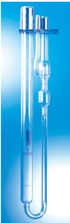
9723-C50 Series 9723-D50 Series

Similar to 9723-B50 series, but uncalibrated.