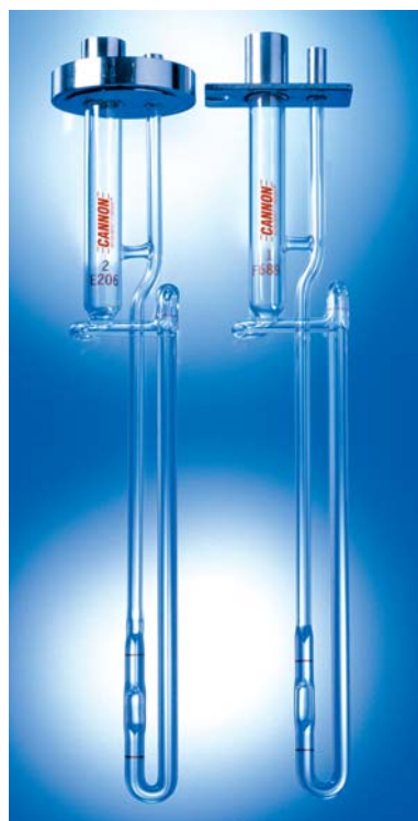
9723-W50 Series 9723-Y50 Series 9724-B50 Series 9724-D50 Series